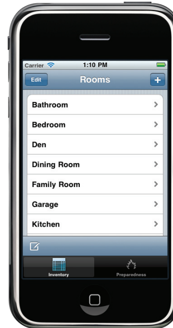
3. Select a room