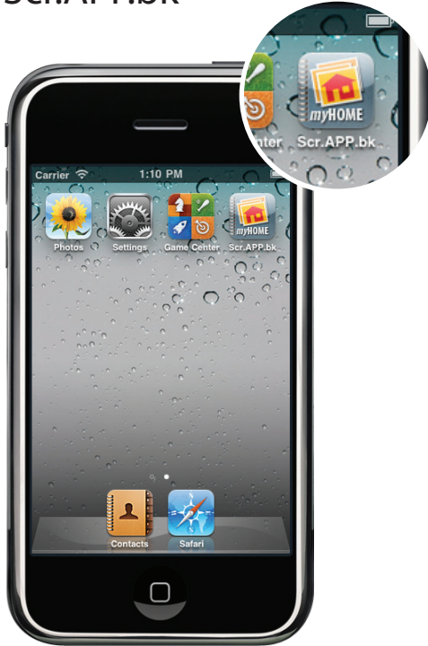
1. Launch Icon

Everyone should have a home inventory to keep track of all their valuable items in case of disaster. This list should be updated regularly and kept handy in case you need to evacuate your home. NOW, WE HAVE AN APP FOR THAT!