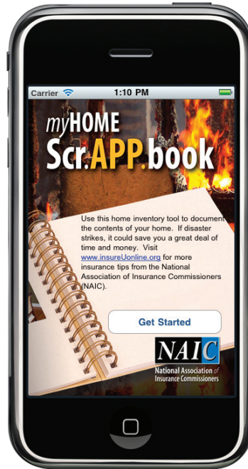
2. Get Started